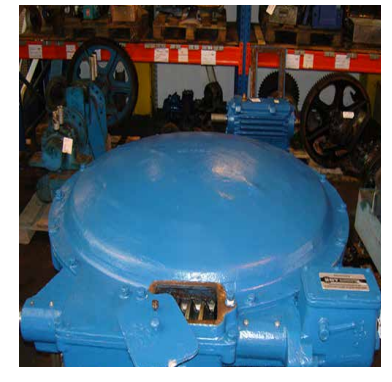
Worm and Wheel Gearbox