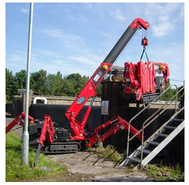
Spider Crane Lifting a Spider Crane