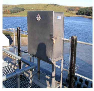
Weather Proof St/St Cabinet (Double)