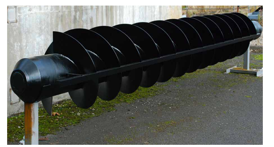
New Archimedes Screw