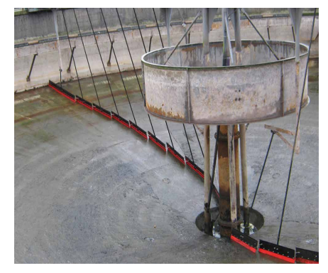
Replacement Scraper System