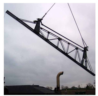
Replacement Grit Rake