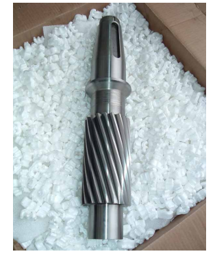
Gear Cut (Replacement Shaft)