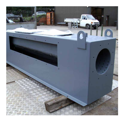
New Compactor Body