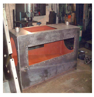
Compactor Body Refurbishment

SBT keep on stock at their facility in Manchester 250mm and 400mm diameter flights, auger tubes & shafts and compactor liner tubes to enable a rapid response to repair and refurbishment requests. As all aspects of this work are in-house, including machining, welding, fabrications and assembly the turnaround time for auger and compactor repairs is kept to a minimum.