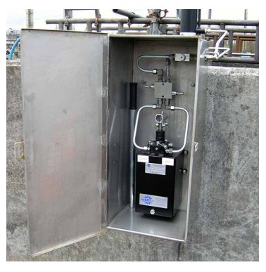
Manually Operated Hydraulic Pump