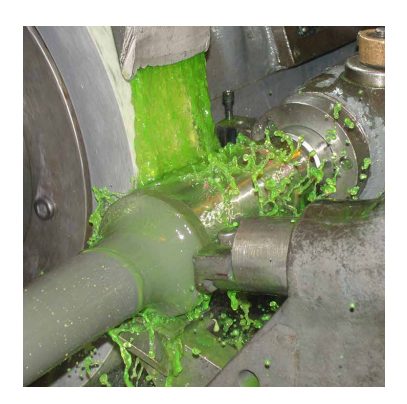
Grinding To Tight Tolerances