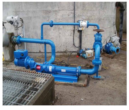
Pump and Pipework Replacement