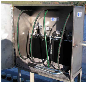
Multiple Penstock Hydraulics