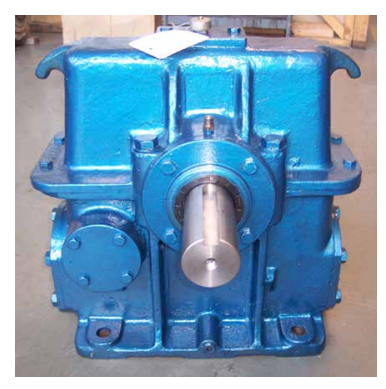
Service Exchange Gearbox

Due to the vast array of equipment installed across the industries served by SBT we are also extremely experienced in manufacturing adaptors and mountings to allow modern solutions to be retrofitted into older, existing installations. The advantage is that there is minimum disruption to the overall installation and/or any associated electrical or control systems.