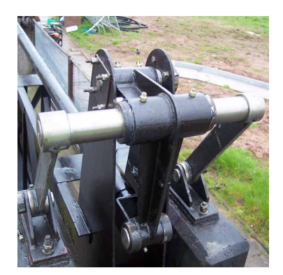
Grit Rake Crank Mechanism