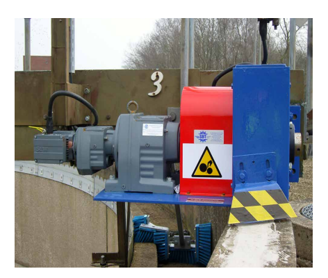
Tank Drive Upgrade