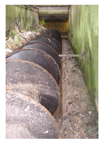
Worn Archimedes Screw