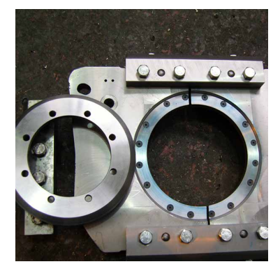
Split Design Re-slurry Bearing