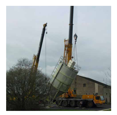
Silo Installation (Tandem Lift)