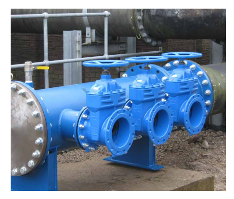
Manifolds Fabricated and Installed