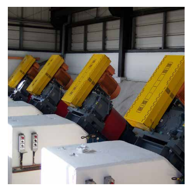
New Screw Pump Drives