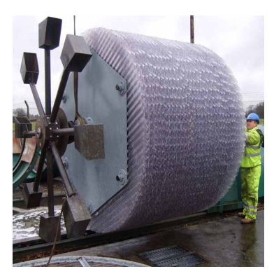
RBC - Repairs and New