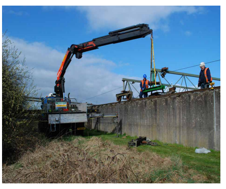
Bridge Carriage Replacement