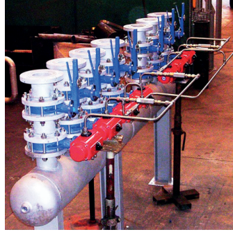
Air Actuated Valve Manifold