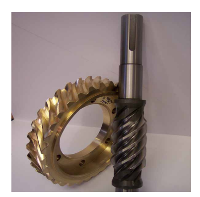
Worm and Wheel Set