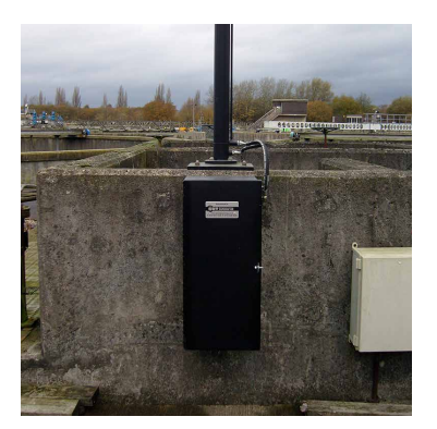
Direct Penstock Control (Single)