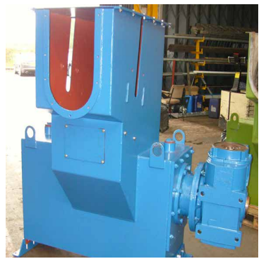
Wash Unit Refurbishment